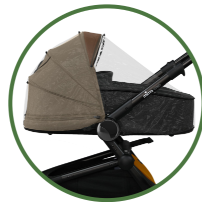
including a carrycot rain cover